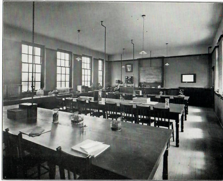
THE BIOLOGICAL LABORATORY.