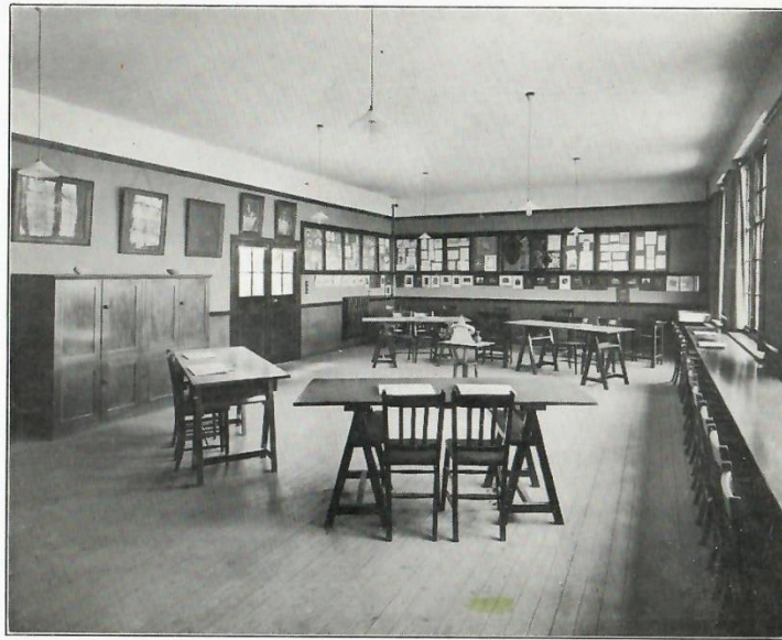
THE ART ROOM.