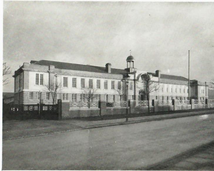
THE N.W. VIEW OF THE SCHOOL.