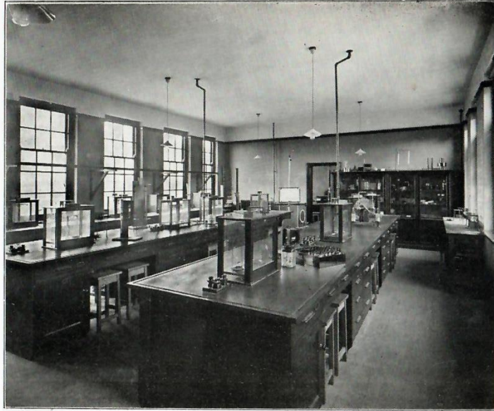
THE JUNIOR PHYSICAL LABORATORY.