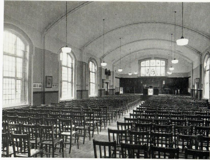
THE ASSEMBLY HALL.

Object. The School provides, for boys and girls from 10 years of age upwards, a sound general education to prepare them for a professional, commercial or scientific career. In addition to Worcestershire children, boys and girls from Smethwick, Birmingham, Staffordshire and Warwickshire may be admitted.