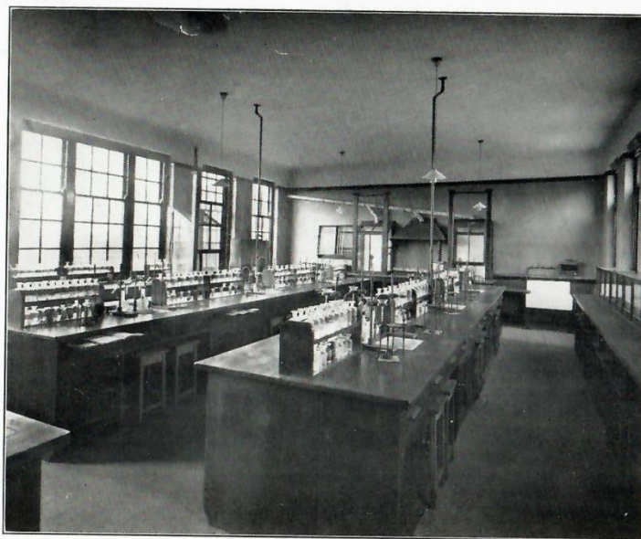
THE JUNIOR CHEMICAL LABORATORY.